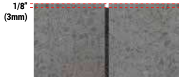
PAVERS OR NATURAL STONES WITHOUT CHAMFER