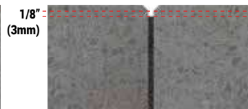
PAVERS OR NATURAL STONES WITH CHAMFER

POLYMERIC SAND REQUIREMENTS Minimum joint width: 1/8" (3 mm) Maximum joint width: 2" (5 cm) Minimum joint depth: 1 1/2" (38 mm)